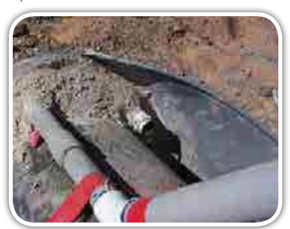
Grout can be seen exiting from the PVC port

The density (unit weight) of the material has a greater effect on the performance of the culvert rehabilitation than the compressive strength value of the grout. Practically any grout selected will be stronger than the bedding material around the host pipe. This is the material that the grout is intended to replace and serve in its absence.