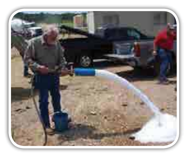
To produce cellular grout, a concentrated foaming agent is required in combination with various types of foam generating equipment. This equipment may generate foam via air pressure or water pressure.

Cellular grout is a low density grout mix comprised of cement and water (or cement, fly ash, and water) with a foaming agent added to inject a large volume of macroscopic air bubbles into the grout mix. This admixture greatly reduces the density, or unit weight, of the grout mix, and often will result in 40% or greater air content in the finished product. A foam generator unit is normally required to obtain such a high percentage of air and to reduce grout density. Most additive manufacturers report a maximum of 20% to